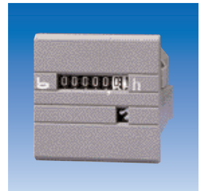
type 631.2, 631.3, 633.2, 633.3, 629.2, 629.3, 637.2, 637.3