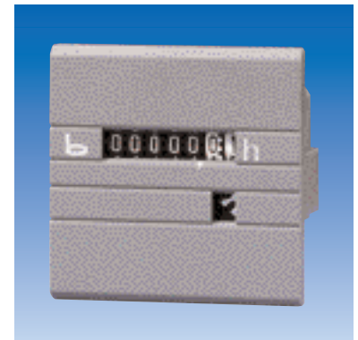
type 631, 631.1, 633, 633.1, 629, 629.1, 637, 637.1