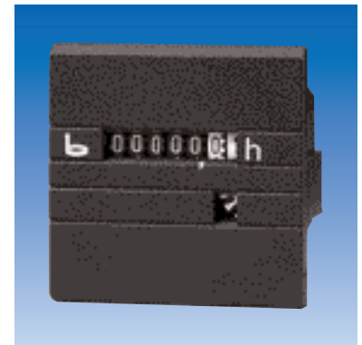
type 632, 632.1, 634, 634.1, 630, 630.1, 638, 638.1