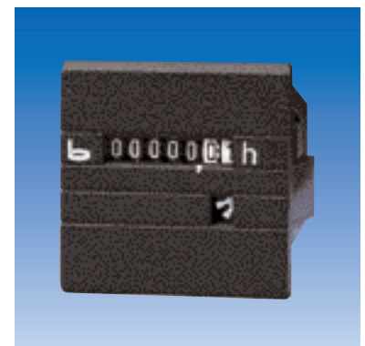
type 632.2, 632.3, 634.2, 634.3, 630.2, 630.3, 638.2, 638.3